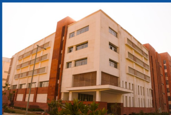
Faculty of Arts and Design