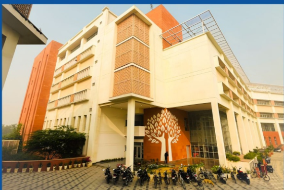
Faculty of Social Sciences