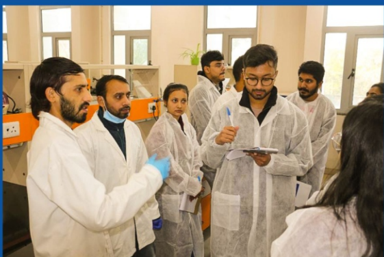
Faculty of Life Sciences and Biotechnology