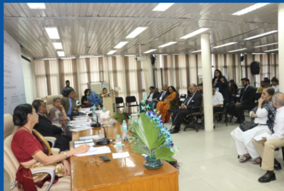
Faculty of Legal Studies