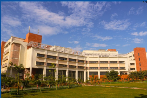
Faculty of Economics

Don't Just Imagine the Future of Education—Create it at SAU!