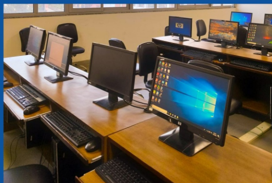
Faculty of Mathematical Sciences