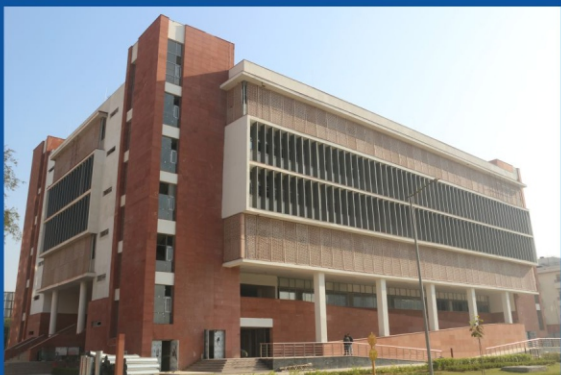
Faculty of Engineering and Technology